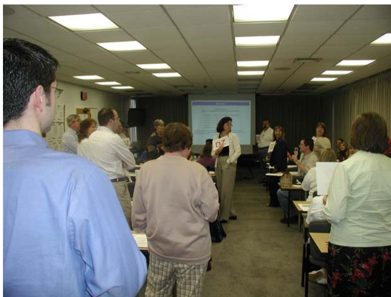
DZ: Workshop participants hypothesize as to why some teachers are sick (DZ) while others remained healthy.