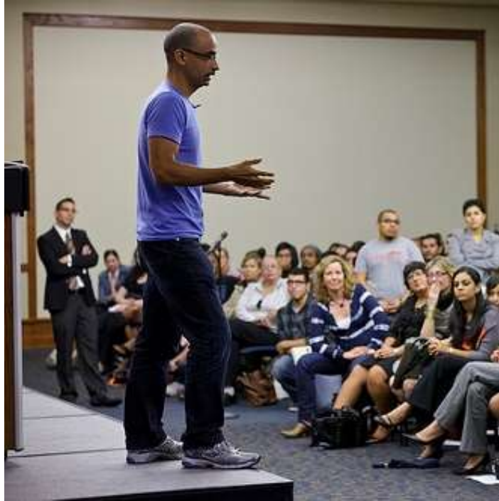
Junot Diaz, author