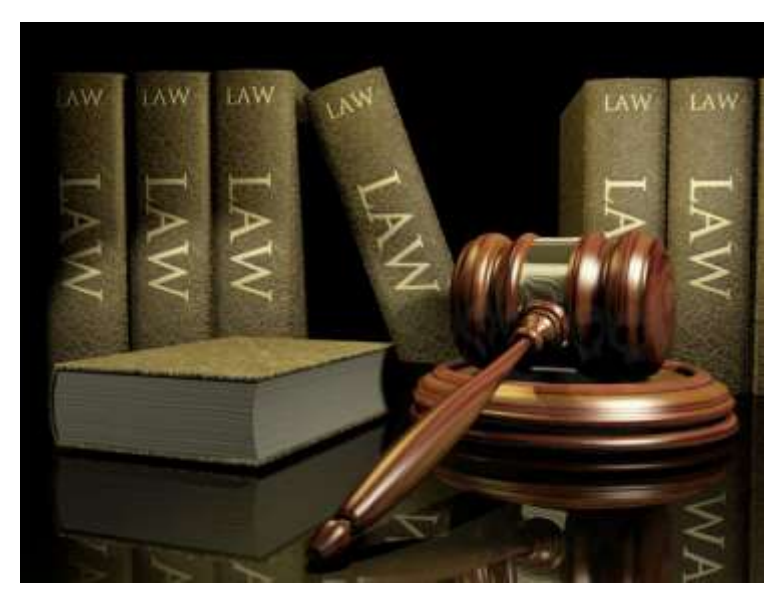
GPA requirement: 2.75

(Cannot be combined with the Paralegal Studies concentration)