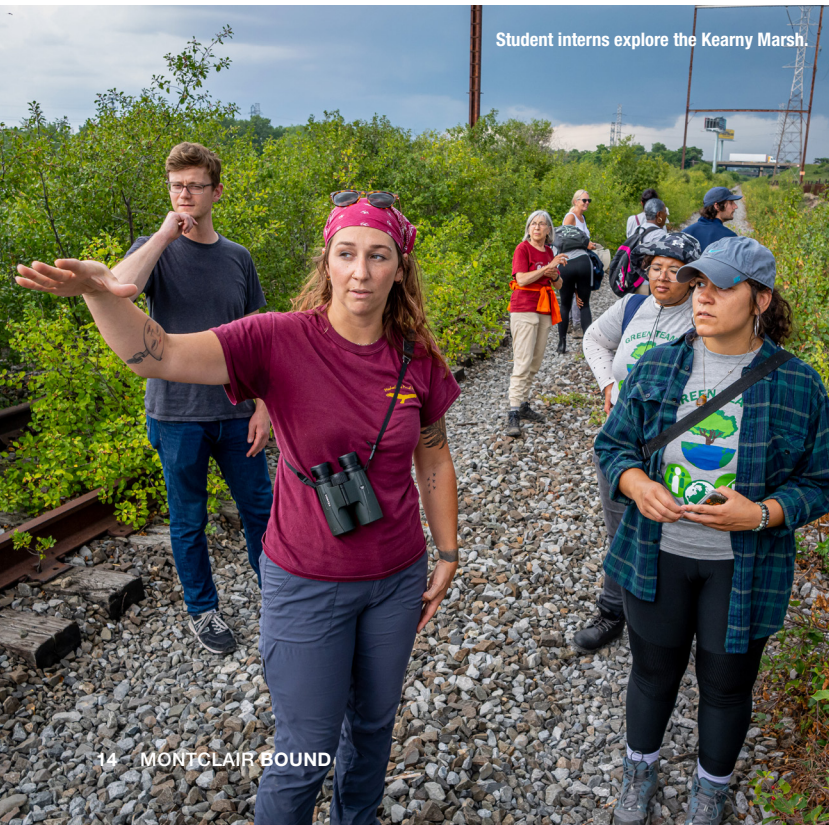
Student interns explore the Kearny Marsh.

Learn more at montclair.edu/early-college-program .