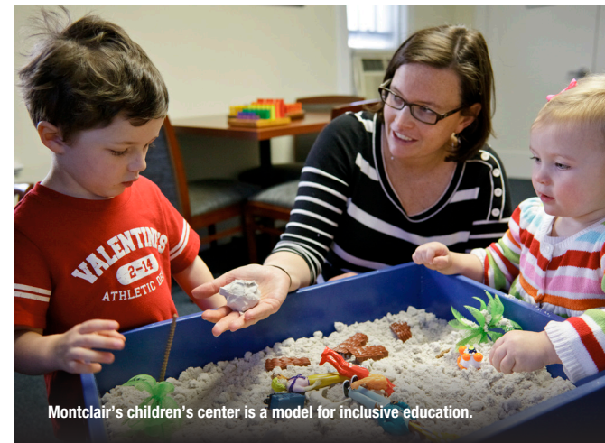
Montclair's children's center is a model for inclusive education.