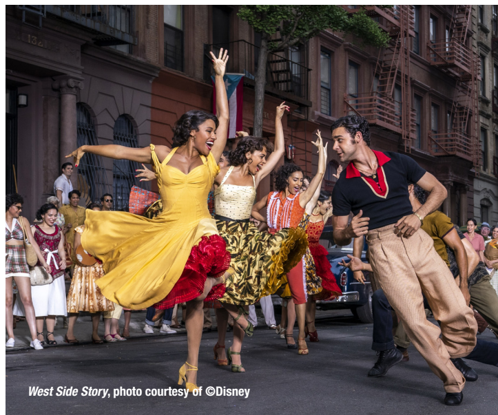
West Side Story

Nursing students even rocked NBC's The Today Show when graduates of the four-year bachelor's in nursing program received their nursing pins live at Rockefeller Center.