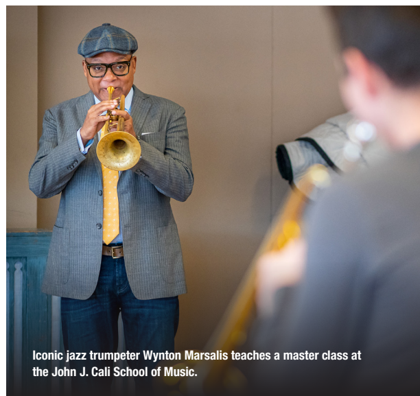
Iconic jazz trumpeter Wynton Marsalis teaches a master class at the John J. Cali School of Music.