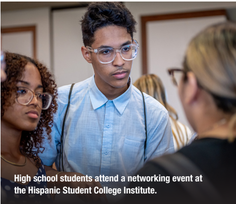
High school students attend a networking event at the Hispanic Student College Institute.

For high school students, summer sessions preview college life