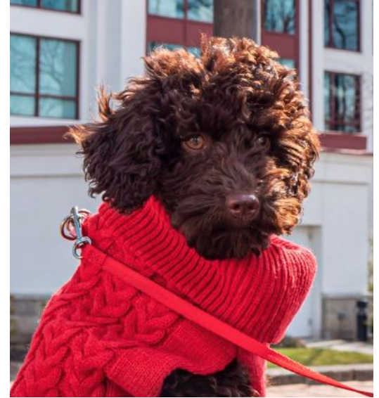
Pebbles Pupscout Services Serotonin Boosts @pebblesredhawk