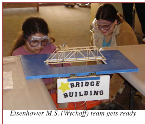
Eisenhower M.S. (Wyckoff) team gets ready