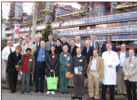
Participants in front of RWTH