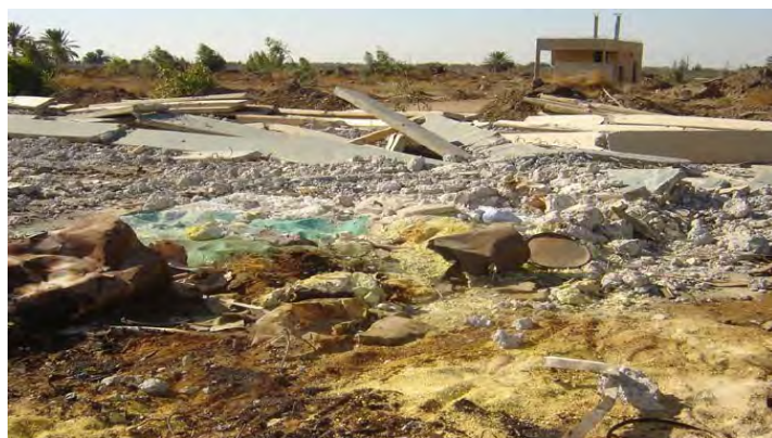
Hazardous chemicals on the land of Qadissiya Site.

For the natural environment, the indicators of importance are biodiversity and sensitivity to degradation. In general, the industrial areas in Iraq are situated in heavily developed regions of low biodiversity and sensitivity. For the population, the pattern of land use in Iraq indicates that the human health issues for contaminated land and hazardous waste are similar to those observed worldwide. [Assessment of Environmental “Hot Spots” in Iraq, UNEP, 2006]. ♦