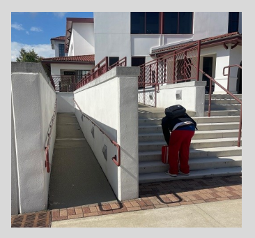
using the transportation on campus requires one to step up onto some shuttle buses, however, <u>individuals with disabili-</u> <u>ties</u> might unable to do so. The students felt people who are physically able to use public transportation are privileged.