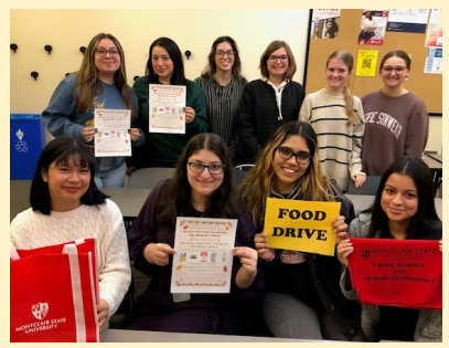
Students in the FSHD Immigrant Families class proudly display signs and flyers advertising their food drive that supported families in the Jersey City area.

rice, dried beans, and cooking oil. It was conducted with creative support from the FSHD Department, the College for Community Health, and beyond. Some FSHD faculty offered extra credit if students made a donation, and the Nutrition and Food Studies Department rallied behind this project to collect a generous amount of groceries! In just three weeks, the drive netted 240 pounds of food to support families in need!