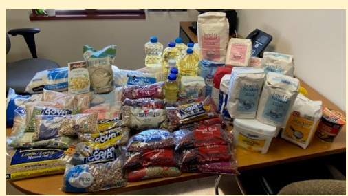
The FSHD food drive reaped 240 pounds of flour, sugar, rice, beans and oil for refugees and asylum-seekers.

The drive specifically focused on collecting five high-demand pantry staples: flour, sugar,