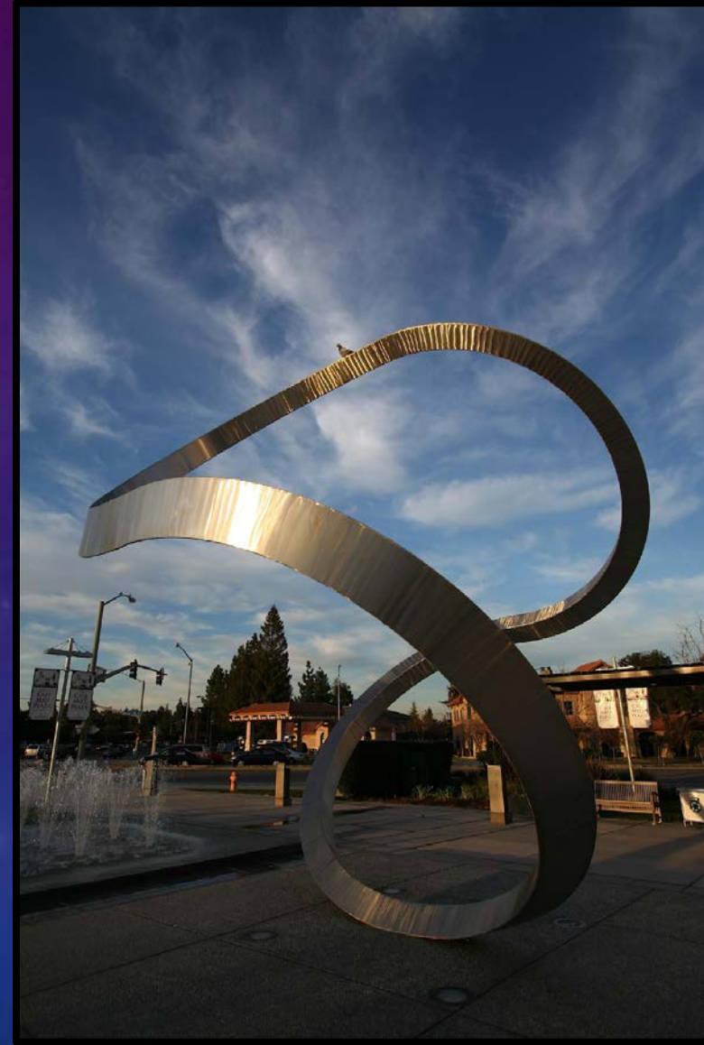
Image source: Photograph of a sculpture in Cupertino, Faruk Ates, 2002

Figure 3. Photograph of a sculpture in Cupertino, California. From Infinite Loop II by Faruk Ates, 2002. Retrieved from: https://www.flickr.com/photos/kurafire/377684448/in/photostream/