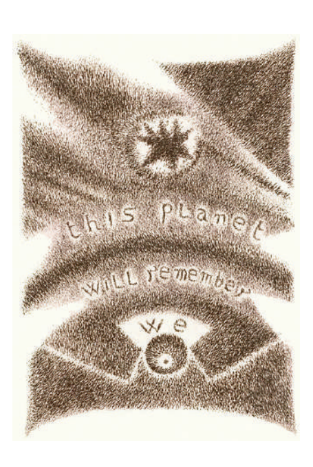
Leo S. Olschki Editore MMXXII