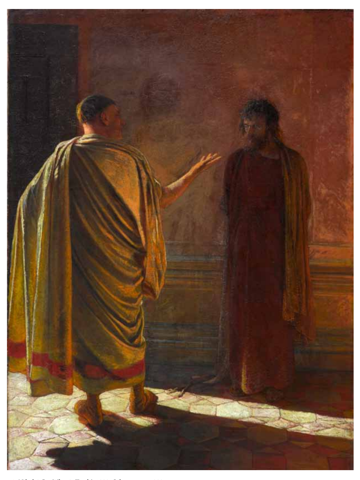
5.2. Nikolai Ge, What is Truth? , 1890. Oil on canvas, 233 x 171 cm, State Tretiakov Gallery, Moscow.