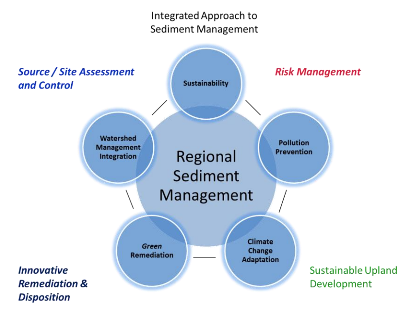
Figure 1: Conceptual Structure for Regional Sediment Management

Ongoing contamination from legacy sediments, runoff from urban, industrial and legacy sites, point and non-point sources (including municipal storm water) can directly affect commerce, economic development and contribute to long-term corporate liabilities, degrading the overall vitality (environmental, social and economic) of the watershed. Restoring impacted waterways and water quality is critical for economic development in urban communities and can offer significant social benefits. However, because of the different individual agency missions, the regulatory environment in both the European Union (EU) and the United States, does not fully consider social, economic, and sustainability factors and instead, focuses exclusively on the environmental drivers without balancing perceived risk and sustainability. This is partially the result of the regulatory system not recognizing the link between sustainability and integrated sediment management. Since much of this work philosophically has focused on soil remediation within artificial, not natural, boundaries, it has been generally difficult to make that linkage because economics is usually the sole driver.