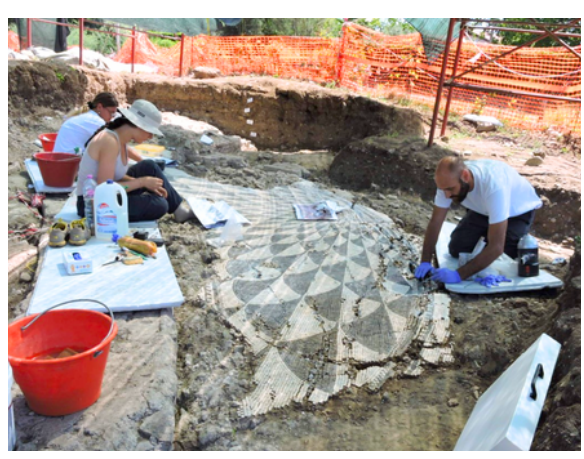
Red Hawks on a faculty-led program in Genzano, Italy, in Summer 2023

Faculty who are interested in taking students abroad in January 2025, Spring 2025, or Summer 2025 should submit through our IAI Request for Proposals process by the deadline of Feb. 15th, 2024 . More details regarding the RFP and application will soon appear here: montclair.edu/study-abroad/faculty-get-involved-with-study-abroad Going through our process ensures that our students, faculty, and staff traveling abroad will be informed and safe, while also protecting the University and its employees from exposure to liability. All proposals should be written by the proposed lead instructor, and will need review and signature by the relevant Chair and Dean. Faculty interested in learning about how these programs work are invited to join the Faculty-Led Programs Workshop on Zoom, Wed. January 17th from 2:30-4pm . Updates about the Zoom link and workshop topics will be posted on the website noted above.