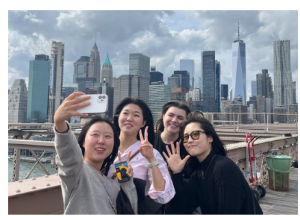
Exchange Students on our Fall 2023 Walking Tour of Lower Manhattan and the Brooklyn Bridge