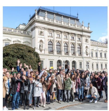
Faculty-Led Program in Graz, Austria