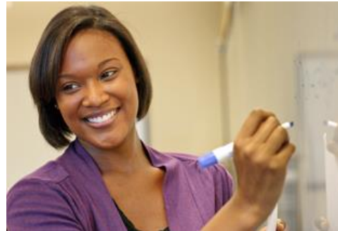
College of Education and Human Services - CEHS