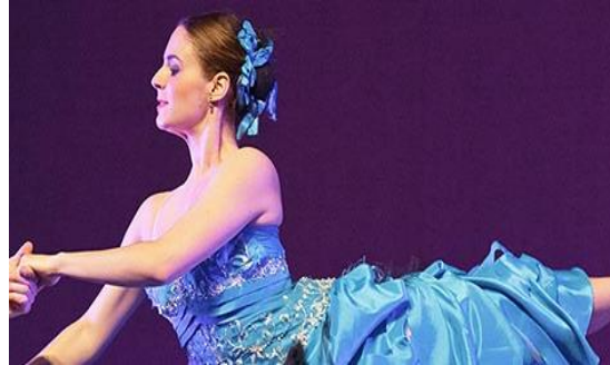
College of the Arts - CART