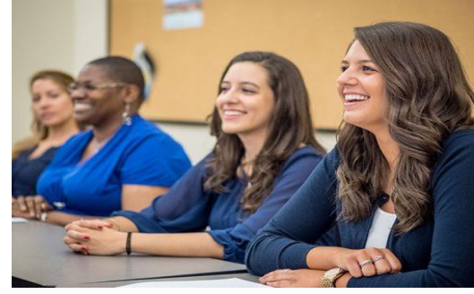
School of Nursing