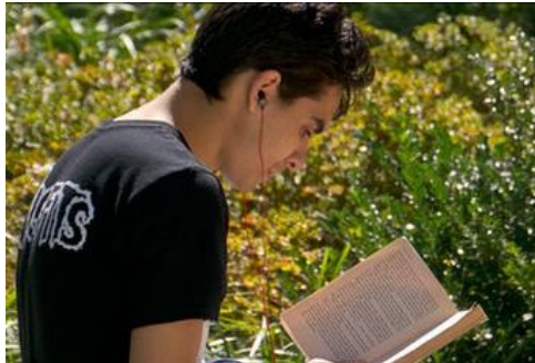
College of Humanities and Social Sciences - CHSS