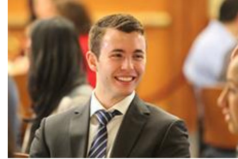
School of Business - SBUS