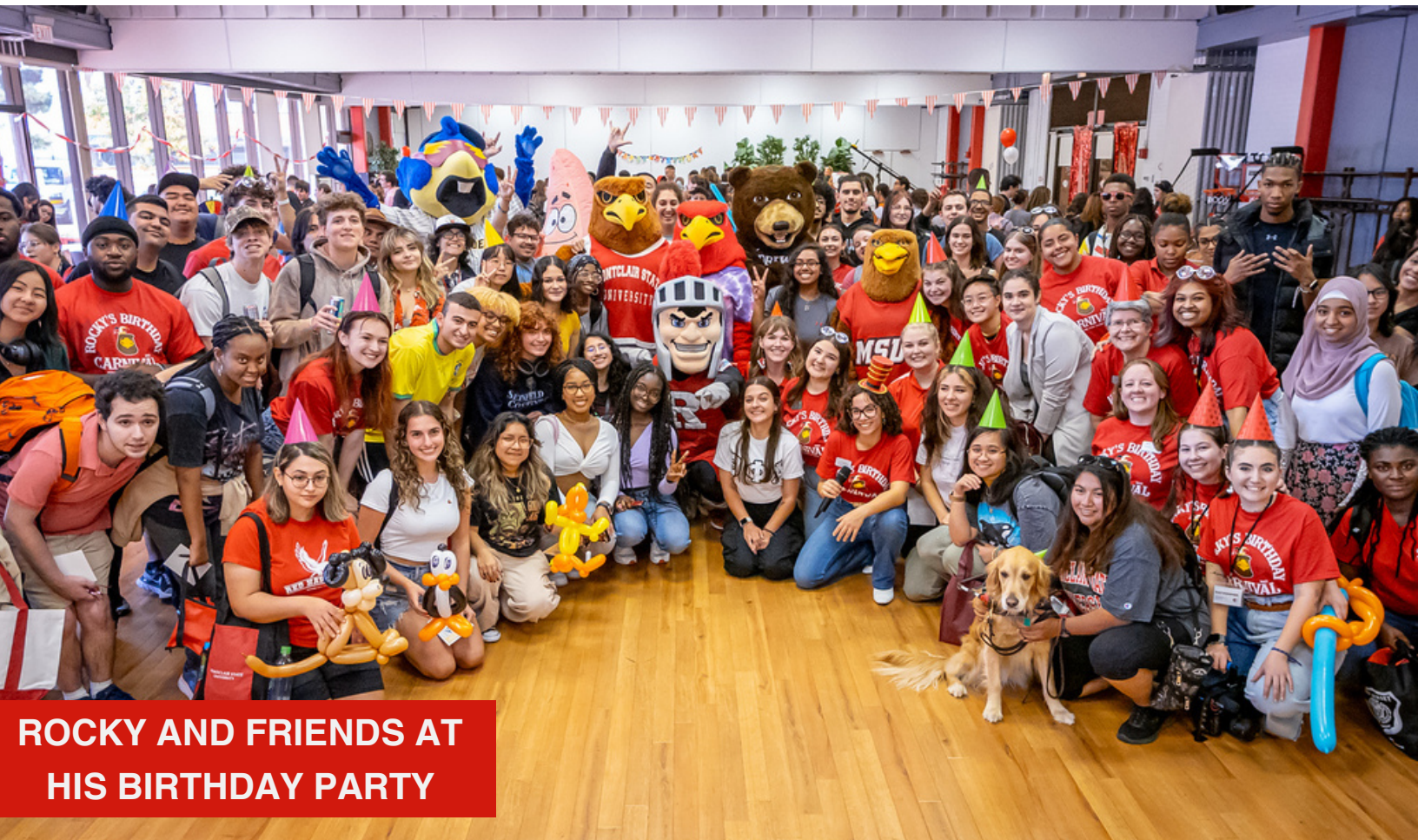
ROCKY AND FRIENDS AT HIS BIRTHDAY PARTY

We encourage you to download the Engage App on your phone and select Montclair State University to learn about the different organizations and events that you can encounter during your time on campus. It will show you when and where events are happening at Montclair State University.