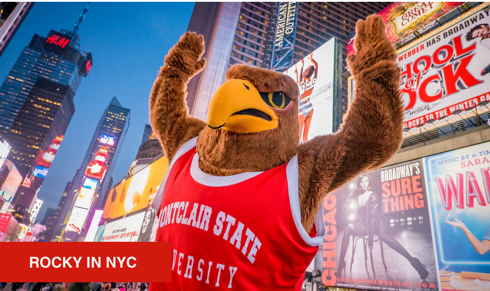
ROCKY IN NYC

Port Authority Bus Terminal has direct underground passageways connect the terminal with NYC Transit subway A, C, E, N, Q, R, W, 1, 2, 3, and 7 trains, as well as the shuttle to Grand Central Terminal.