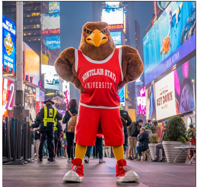
ROCKY THE RED HAWK CAMPUS MASCOT Instagram: @rockyredhawk