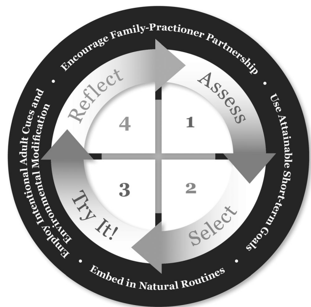
Fig. 1 Foundations steps with key features of Foundations Intervention

Our research team iteratively developed the Foundations Intervention over many months prior to this pilot study to address the need for family-professional partnership in setting mutual goals for young children who needed more structured support to engage, self-regulate, and makes choices/solving initial problems within home and school environments. Figure 1 illustrates intervention steps: (1) Assess child strengths and needs using an adapted routines-based format that involved discussion by the parent and teacher as to immediate needs of a child within home and/or school; (2) Select a strategy to intervene at home and school; (3) Try It , using the identified strategy, technique, or visual/auditory prompts decided upon by the intervention partners, with support from the facilitator; and (4) Reflect , or evaluate what worked at home and school as viewed in brief video clips and use of goal