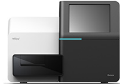
Figure 1: MiSeq System —The compact MiSeq System is well suited for rapid, cost-effective next-generation sequencing.