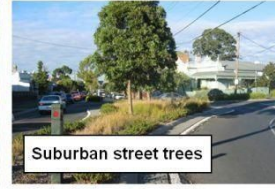
Suburban street trees