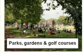
Parks, gardens & golf courses