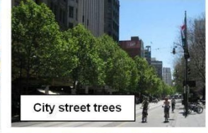
City street trees