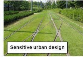
Sensitive urban design