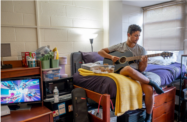
Our students share must-know tips to make your back-to-school transition seamless.