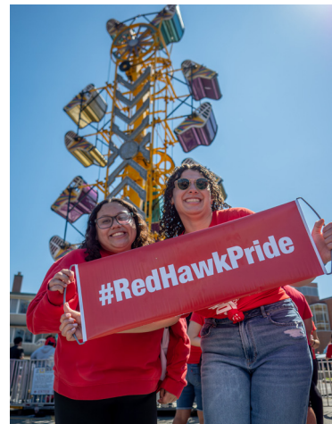
Students enjoy carnival rides during Welcome Week, marking the start of a vibrant fall semester.