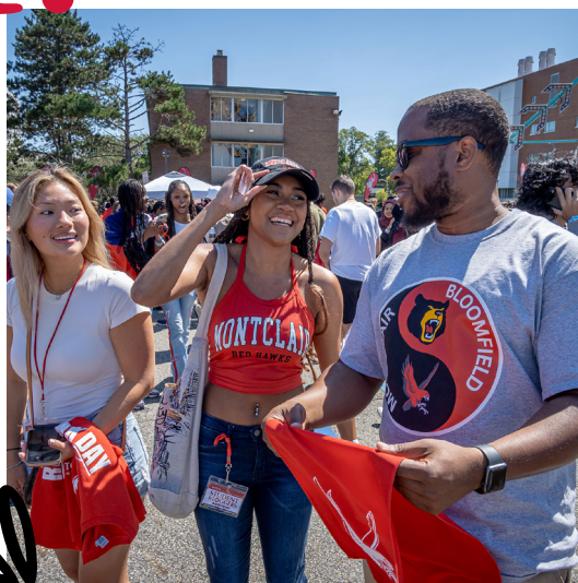
Students connect during Red Hawk Day, a Welcome Week tradition featuring carnival rides, club fairs and special activities.