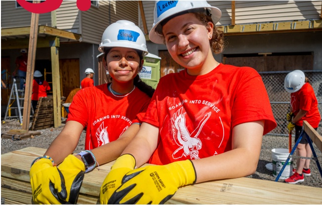
Montclair volunteers help with a Habitat for Humanity project in Paterson, New Jersey.

Montclair students make an impact locally and globally: