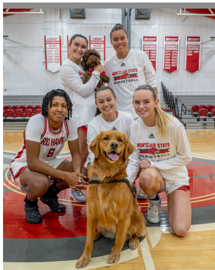
Red Hawk women's basketball players share a joyful moment with Pebbles, the campus mini labradoodle, and Charley, the "Director of Pawsitivity."

At Montclair, success means thriving academically, socially and personally.