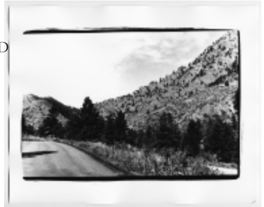
Andy Warhol, Landscape , gelatin silver, undated,

Montclair State University Permanent Collection